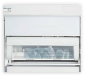
L4 Mini Glass