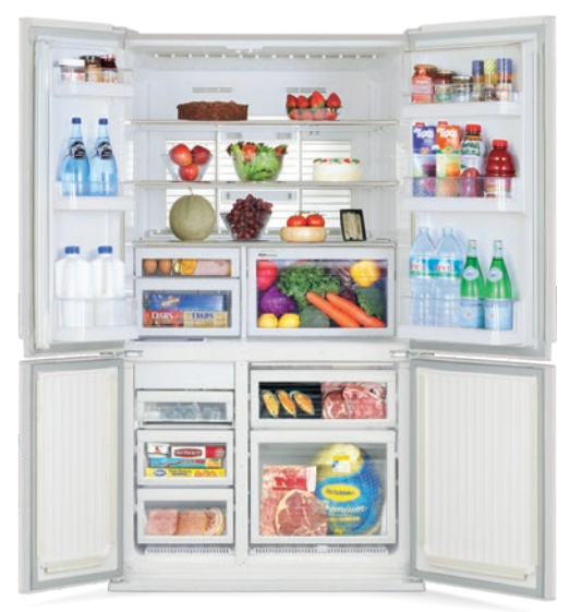
L4 Grande Glass