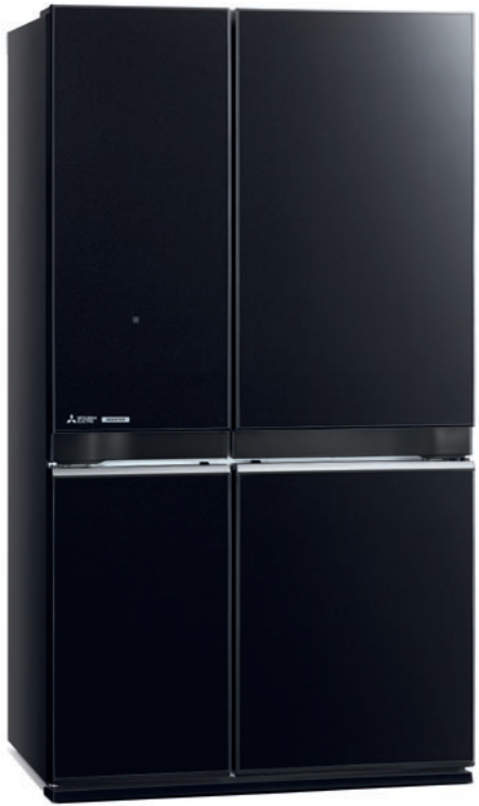
MR-LA635ER 635 Litres MR-LA580ER 580 Litres